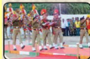
RETREAT (PARADE) BY BSF