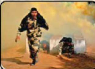
FILM ON BSF