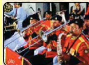
FUSION BAND BSF