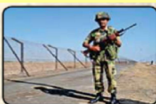
VISIT TO INDIA PAKISTAN BORDER